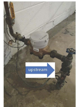
Water meter and service line originating from the floor.